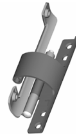
VALUE ADDED ASSEMBLY