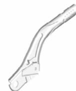
HEAVY GAUGE MATERIAL

Our in house engineering staff helps take these product capabilities one step further with a full compliment of "custom" manufactured products. High volume parts manufactured to your exact specifications.