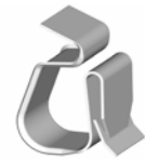
FOURSLIDE W/HEAT TREATING